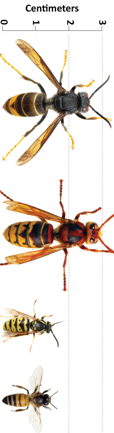
Asian Hornet Vespa velutina