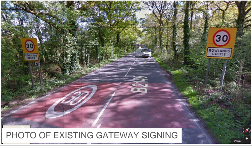
PHOTO OF EXISTING GATEWAY SIGNING